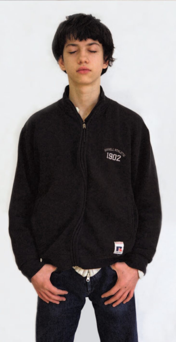
INSIDE OUT, 2005, Farbfotografie | colour photo, 126,5 x 63,5 x 2 cm