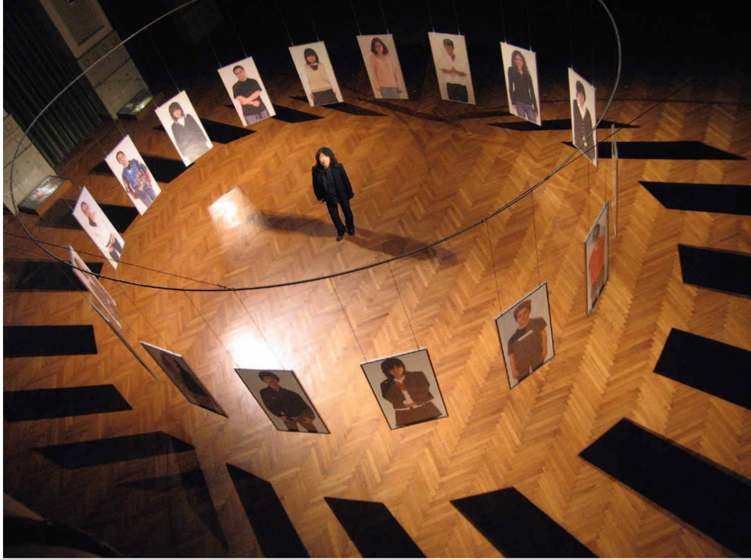
OBEIN | TOP: INSIDE OUT , 2005, Farbfotos, Leuchtkästen | colour photos, light boxes RECHTS OBEIN: Installationsansicht, Jugendstiltheater, Otto-Wagner-Spital, Wien, 2005 | TOP RIGHT: installation view, Jugendstiltheater, Otto Wagner Hospital, Vienna, 2005